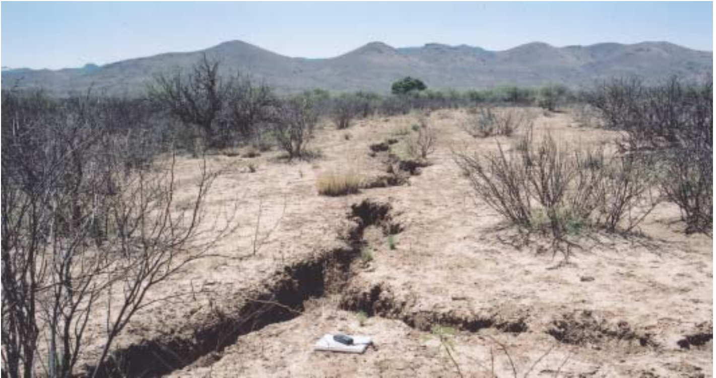
Figure 3. Recently opened desiccation cracks that are part of the same polygonal network shown in Figure 1.

GDCs undergo shrink-swell cycles rather than being the result of a one-time-only desiccation subsequent to deposition of the clay. The newest phase of cracking is believed to be the result of a severe ongoing drought.