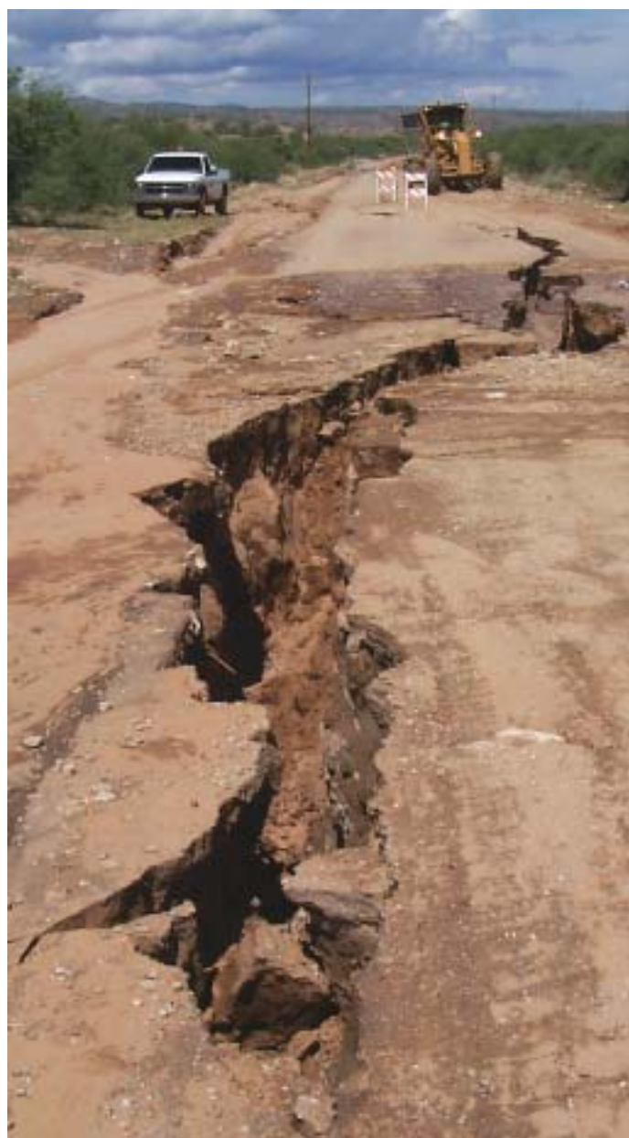
Figure 1. This crack in a Graham County road in southeastern Arizona looks like an earth fissure caused by groundwater pumping, but is actually part of a network of polygonal desiccation cracks.

Raymond C. Harris Arizona Geological Survey